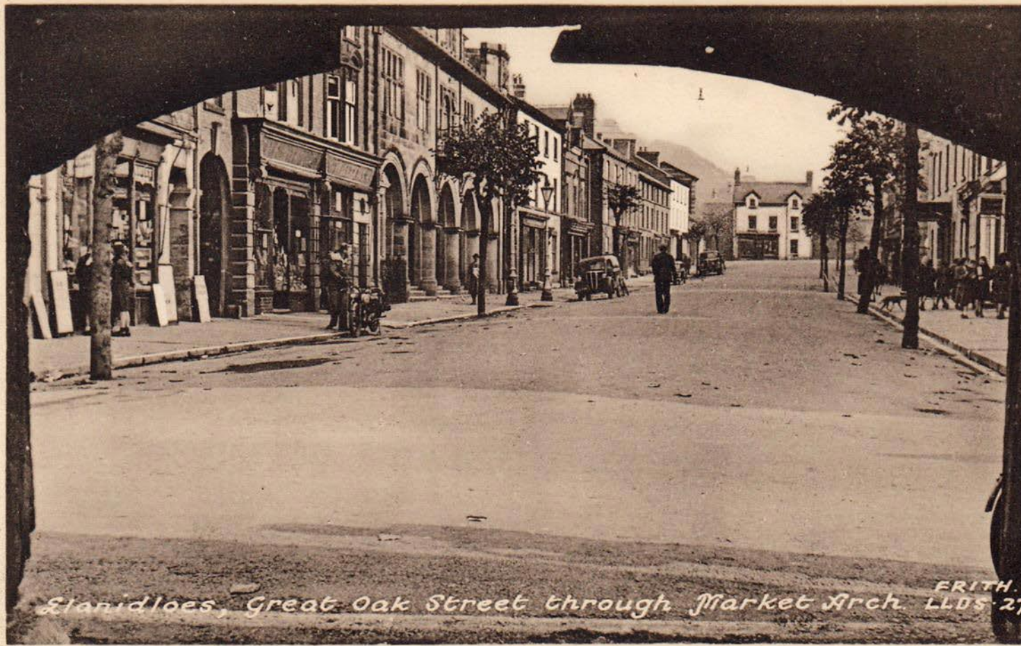
Stanidloes, Great Oak Street through Market Arch. ERITH. LLDS-27.