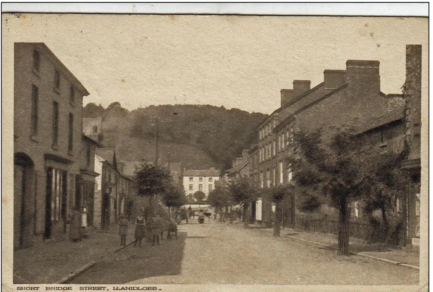
SHORT BRIDGE STREET, LLANIDLOES